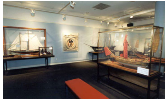
The ships Gallery is home to a beautiful collection of antique ship models, paintings and nautical artifacts.

The serene ambiance and superior acoustics of the St. Nicholas Chapel make it the perfect location for musical events. Windows on the east and skylights on the north and west illuminate this interfaith chapel. The deep blue clerestory window reflects the constellations at night and, in conjunction with the curved, vaulted ceiling and the white maple altar, lends a dramatic quality to the elegant simplicity of the chapel.