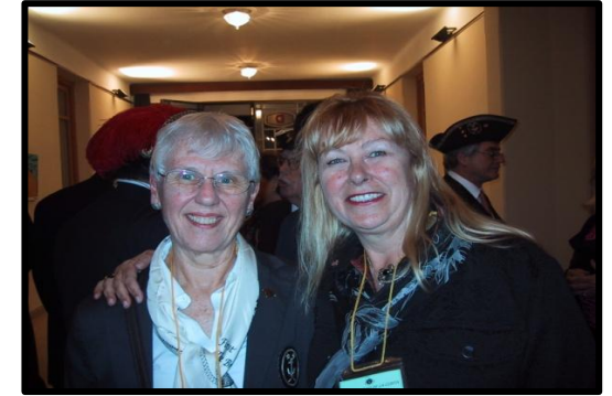
Two Old Friends