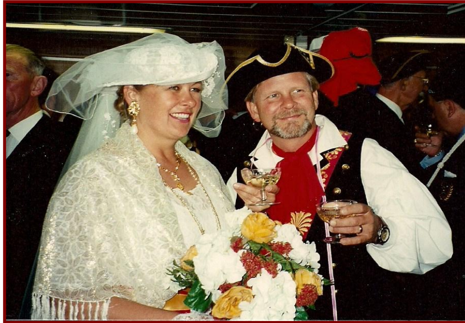
Cape Horn Wedding, aboard Aquiles. October 1994

...that they might have life, and that they might have it more abundantly. John 10:10