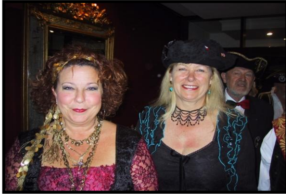
Two Pirate Ladies

Montevideo and Buenos Aires, November 2006 Brotherhood of the Coast