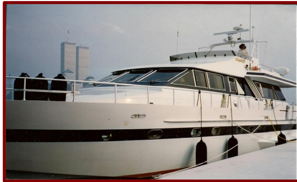
Yacht "Magic", summer 2000.